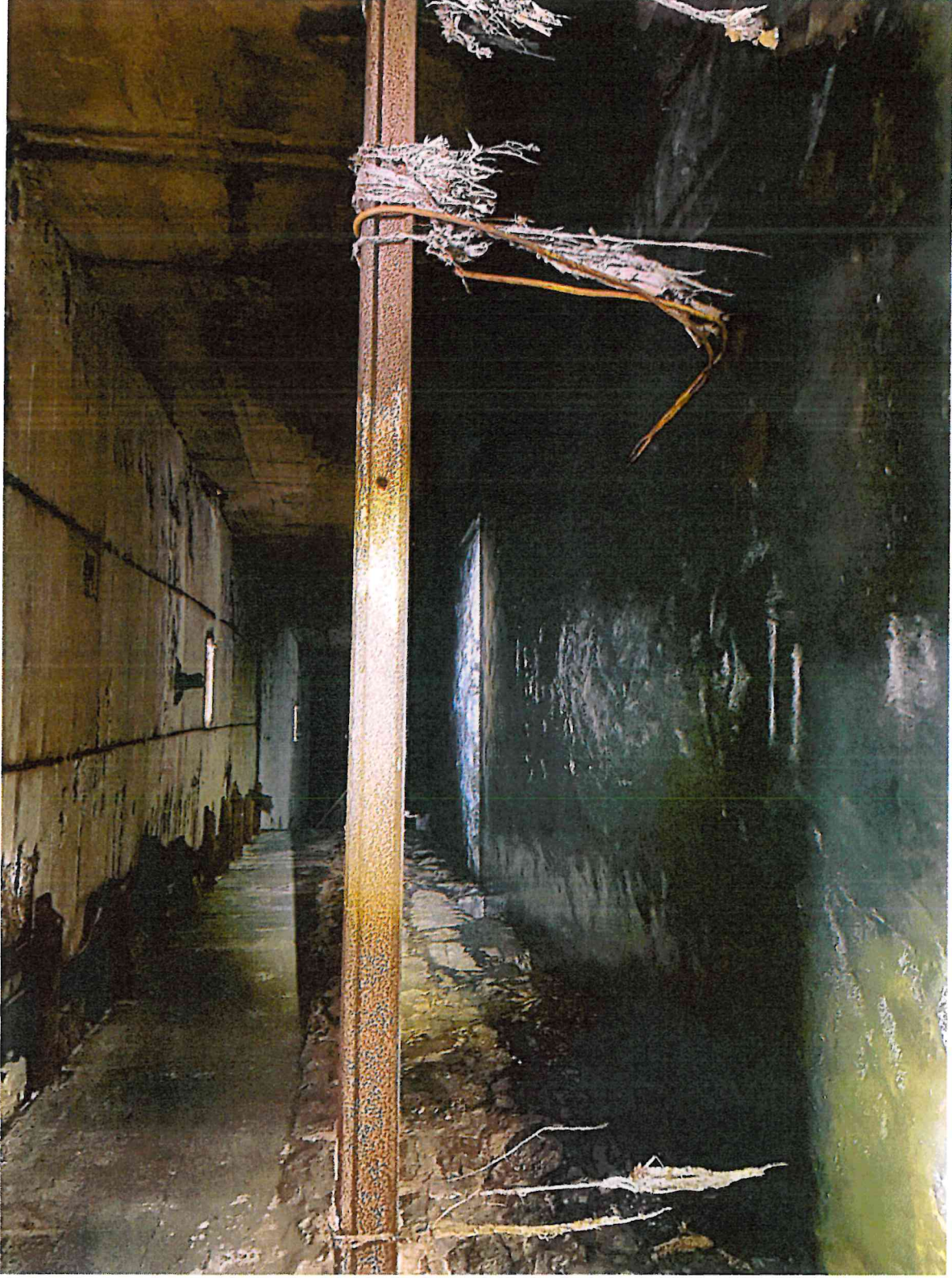
Exhibit 1: Looking downstream (South) from the inlet outside of Lotus Nail Salon at a 4 1 / 2 " railroad rail spanning across the culvert.