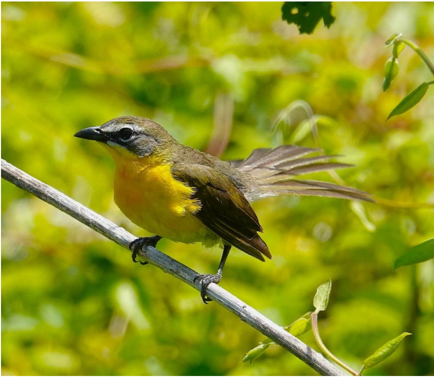
A Yellow-breasted Chat at Hopewell-Big Woods Trail

territories at BML 4/3 (JS) and 4/15 (BL), and near Shoemakersville 5/23 (KG). Finding Lincoln's Sparrows in May is harder than it is in fall. Three were reported, one at Big Woods Trail 5/4 (BR), one in Bern Twp. 5/10 (ZS), and one at LO 5/6 (DBr).