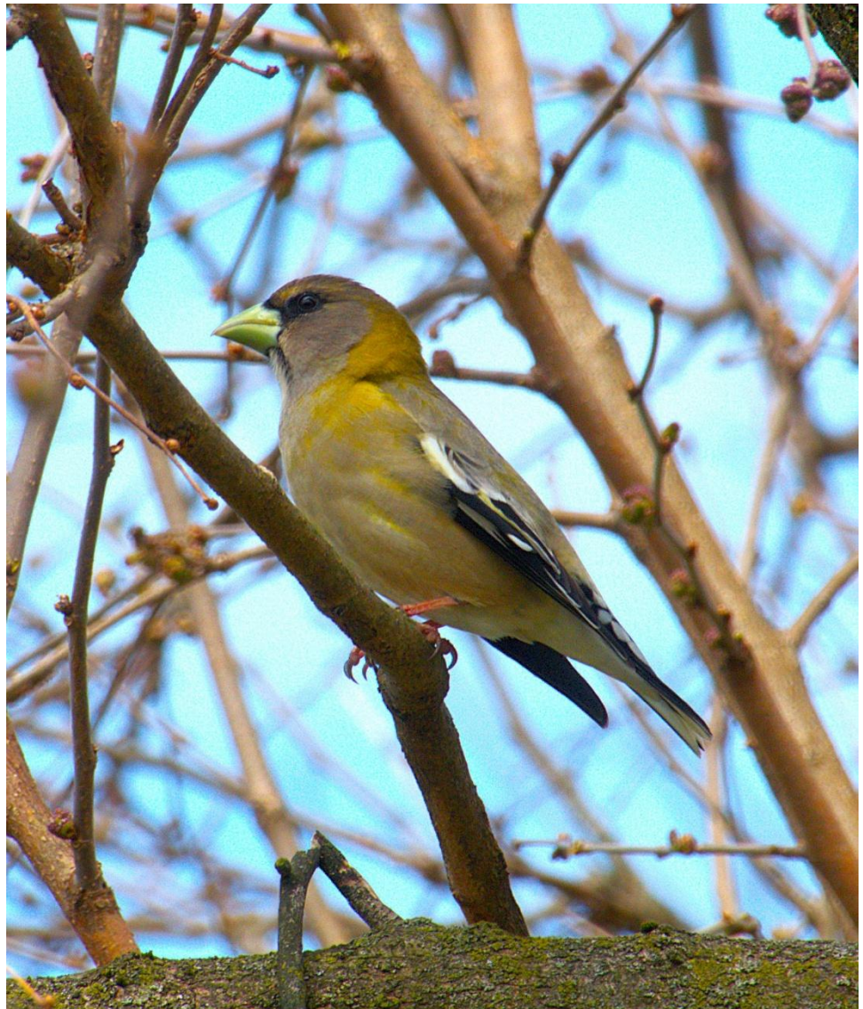
The Evening Grosbeak at Matt Wlasniewski's feeder in Hamburg

The largest spring count of the once abundant American Tree Sparrow was of 11 birds at BML 3/1 (JT). One to three birds per checklist were the norm at the 10 other places reporting them till 4/17. An exceptionally large flock of 20 Vesper Sparrows was counted in a field with Horned Larks along Ridge Rd. north of LO 4/5 (AW). The other three VESP reports were of single birds probably on breeding