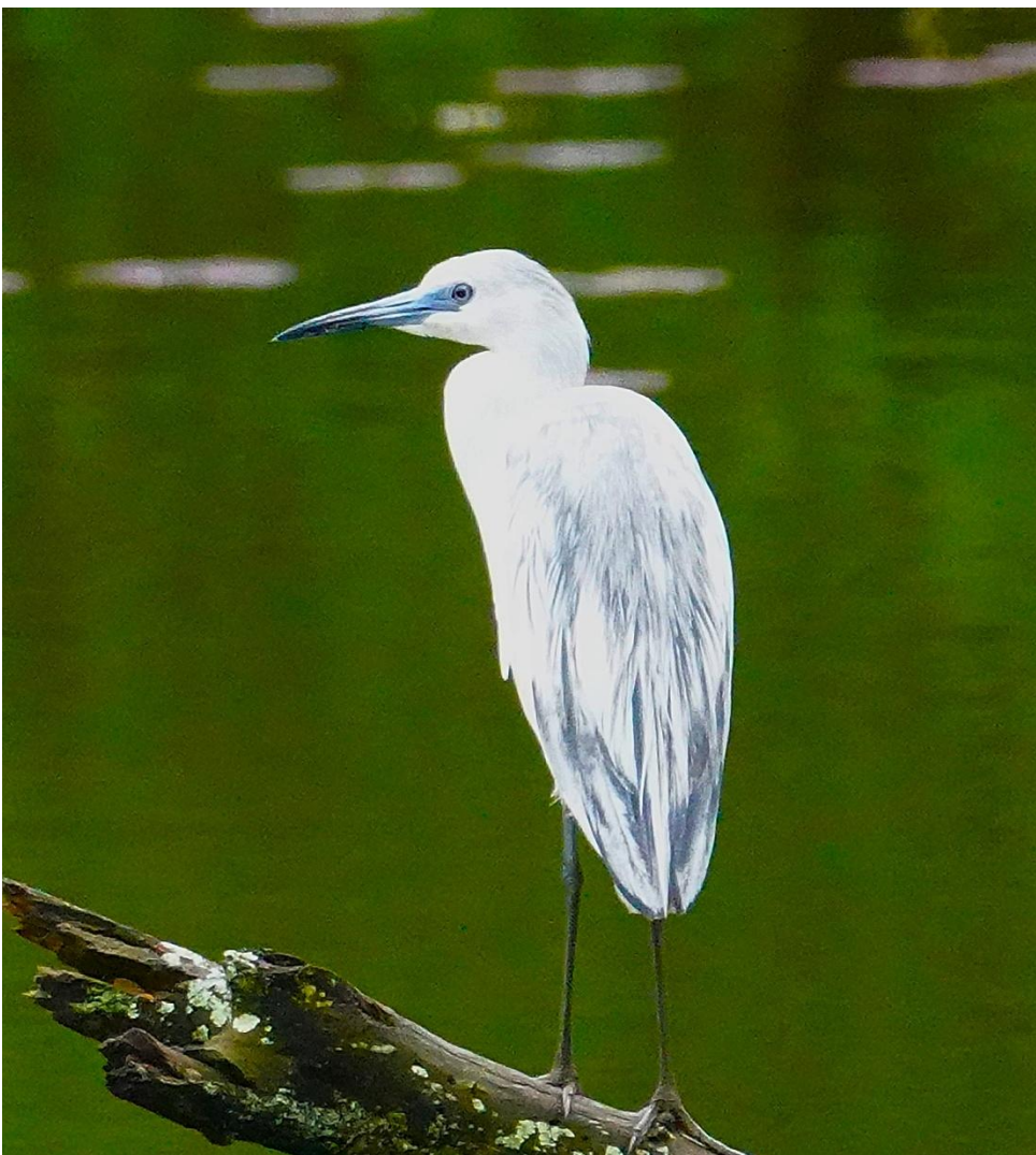
A Little Blue Heron in transitional plumage at Hopewell Lake in French Creek State Park, See page 3 for more information.