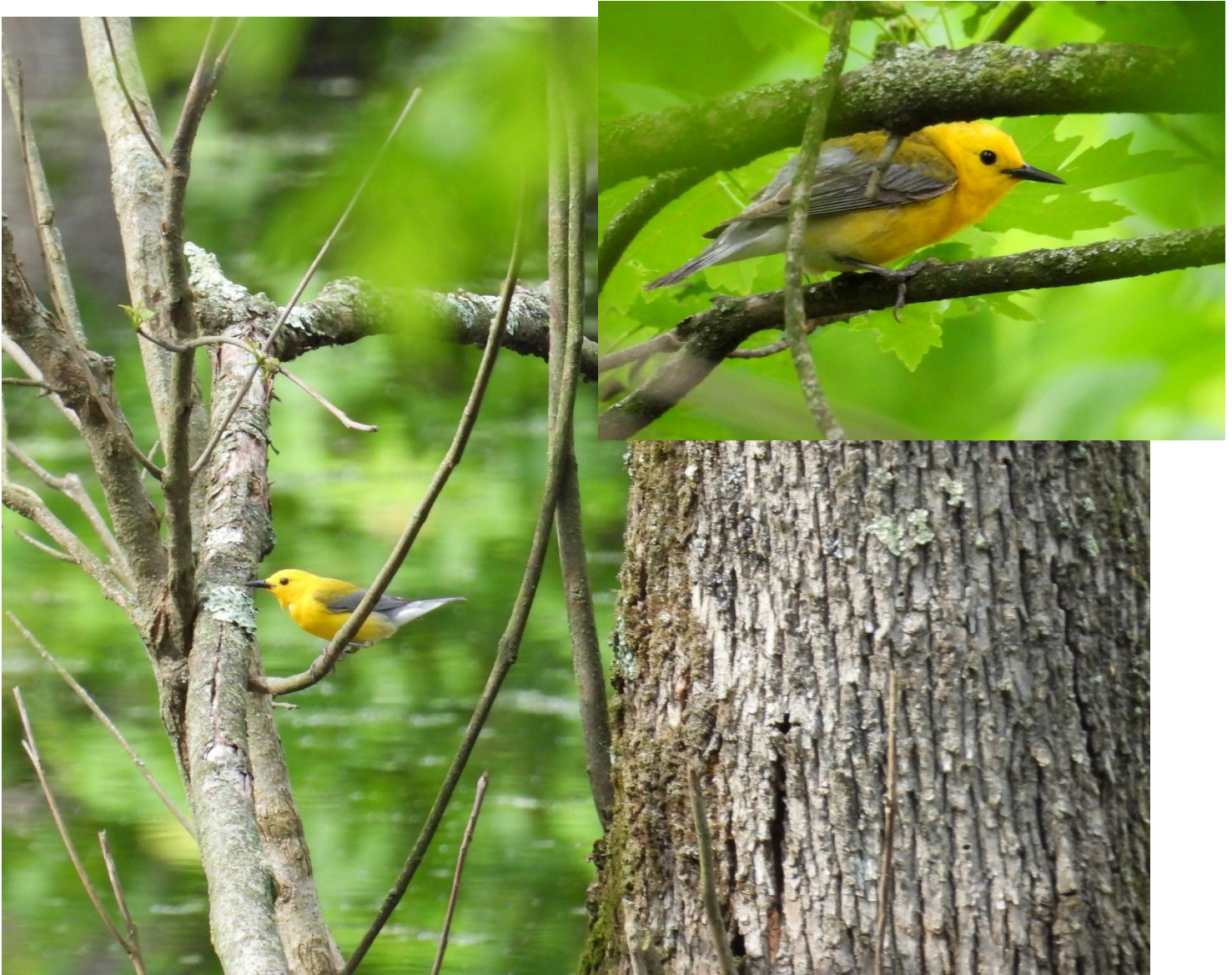
A male Prothonotary Warbler at a wooded swamp along the Schuylkill River.

Male Prothonotary Warblers that overshoot the breeding range are found almost every spring, usually near or along the Schuylkill R. in southern Berks. One was at Daniel Boone Homestead 5/4 (KF). One sang near Gibraltar 5/8-11 (RH, JK, et al.). One sang near Old Morlatton Village 5/16-20 (JK< et al.). Two Mourning Warblers were found, one at HR 5/23 (TF) and the other at PSR 5/26 (AC, AM-G).