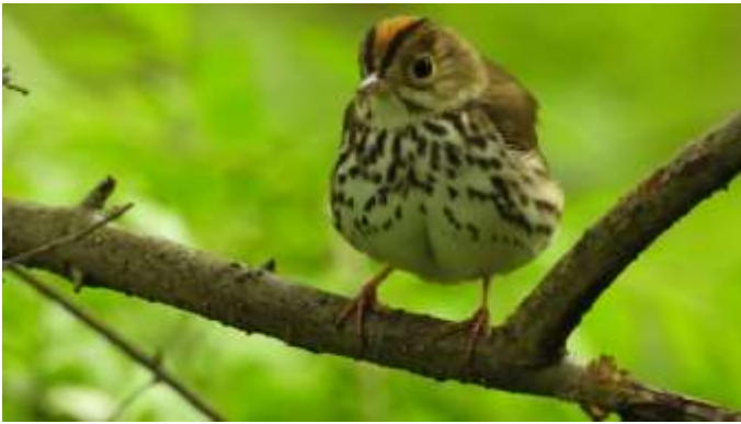
An Ovenbird, a common breeding species in the woodlands of Pennsylvania, at Buxton Conservancy, Brecknock Twp., Berks Co.. 05/08/2021, Photo by Slater

The warbler waves of yesteryear continue to be that as the anticipated arrival of the colorful birds fell short again. Birders spread throughout Berks made reports of a variety of species but usually in numbers of under five or ten. Some sightings of note were: Prothonotary Warbler 5/4 Wyomissing Park (LCr), Cape May Warbler 5/4 – 5/9 LOBC (AW, MW), Cerulean Warbler 5/7 BC (MSI), Bay-breasted Warbler 5/10 Kutztown (TU), Yellow-