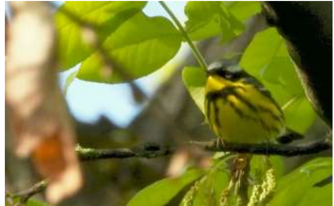
Magnolia Warblers were seen by many observers in Berks as usual. This male was at Buxton Conservancy, Brecknock Twp., Berks Co.. 05/08/2021

The warbler waves of yesteryear continue to be that as the anticipated arrival of the colorful birds fell short again. Birders spread throughout Berks made reports of a variety of species but usually in numbers of under five or ten. Some sightings of note were: Prothonotary Warbler 5/4 Wyomissing Park (LCr), Cape May Warbler 5/4 – 5/9 LOBC (AW, MW), Cerulean Warbler 5/7 BC (MSI), Bay-breasted Warbler 5/10 Kutztown (TU), Yellow-