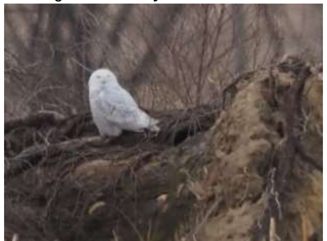
Snowy Owl near Topton.