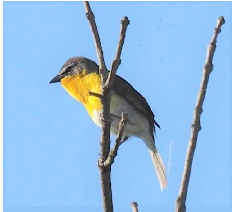
Yellow-breasted Chat.

And, the CICADAS! Many birdwalks throughout late spring were force-serenaded with their “interesting” music, whether we liked it or not! With such sighting success all along our walk, the mood of the group was so sunny & playful that someone discovered – if you cup your ears with your hands while facing the woods frontage, the cacophony actually INCREASED fourfold! If you could STAND it!