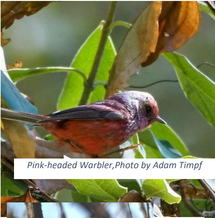
Pink-headed Warbler

see sortie toward a copse of trees beyond the parking lot, we ticked off Orange-breasted Bunting – and, be still my heart! – Red-breasted Chat - in the space of five minutes! The Chat – in its vibrant, vivid, indescribably bright, there-are-no-words-the-astounding-hue breast, illustrated the very DEFINITION SPLIT in nature between “Rufous” ... and “RED!!!”