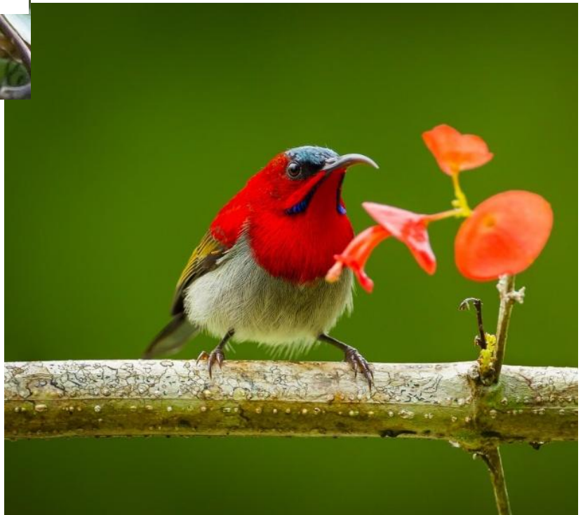
Crimson Sunbird, photo from the EagleEyeTours website.