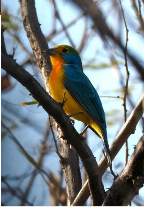
Orange-breasted Bunting, Photo by Adam Timpf