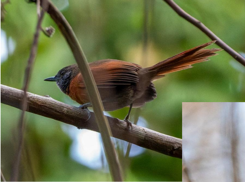
Rufous-breasted Spinetail

(while in the same hemisphere) to experience so vast the color range, tint-&-hue nuances and eloquent, almost prayerful monikers of Mexico’s amazing offering of pinkish-to-rosy-to-brownish-to-rouge-to-rufous-to-red feather tones!