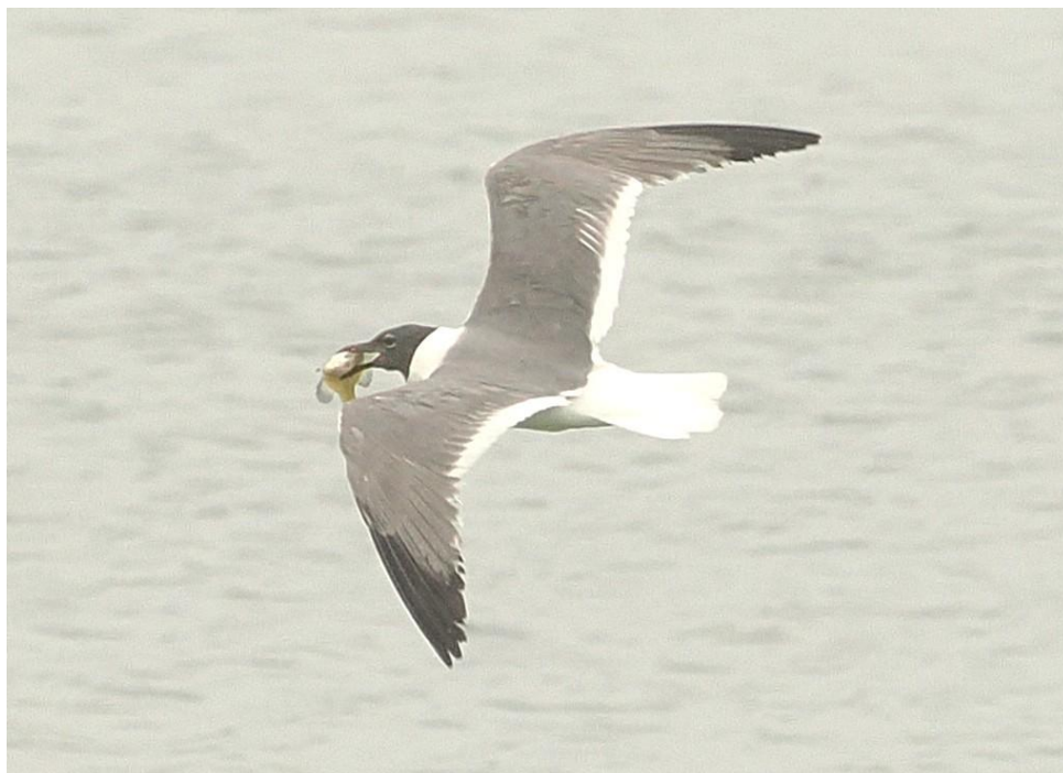
Laughing Gull at Blue Marsh Lake .

A Laughing Gull spent a rainy day at the BML beach 6/16, where it was photographed catching a fish (RH, RK, BL).