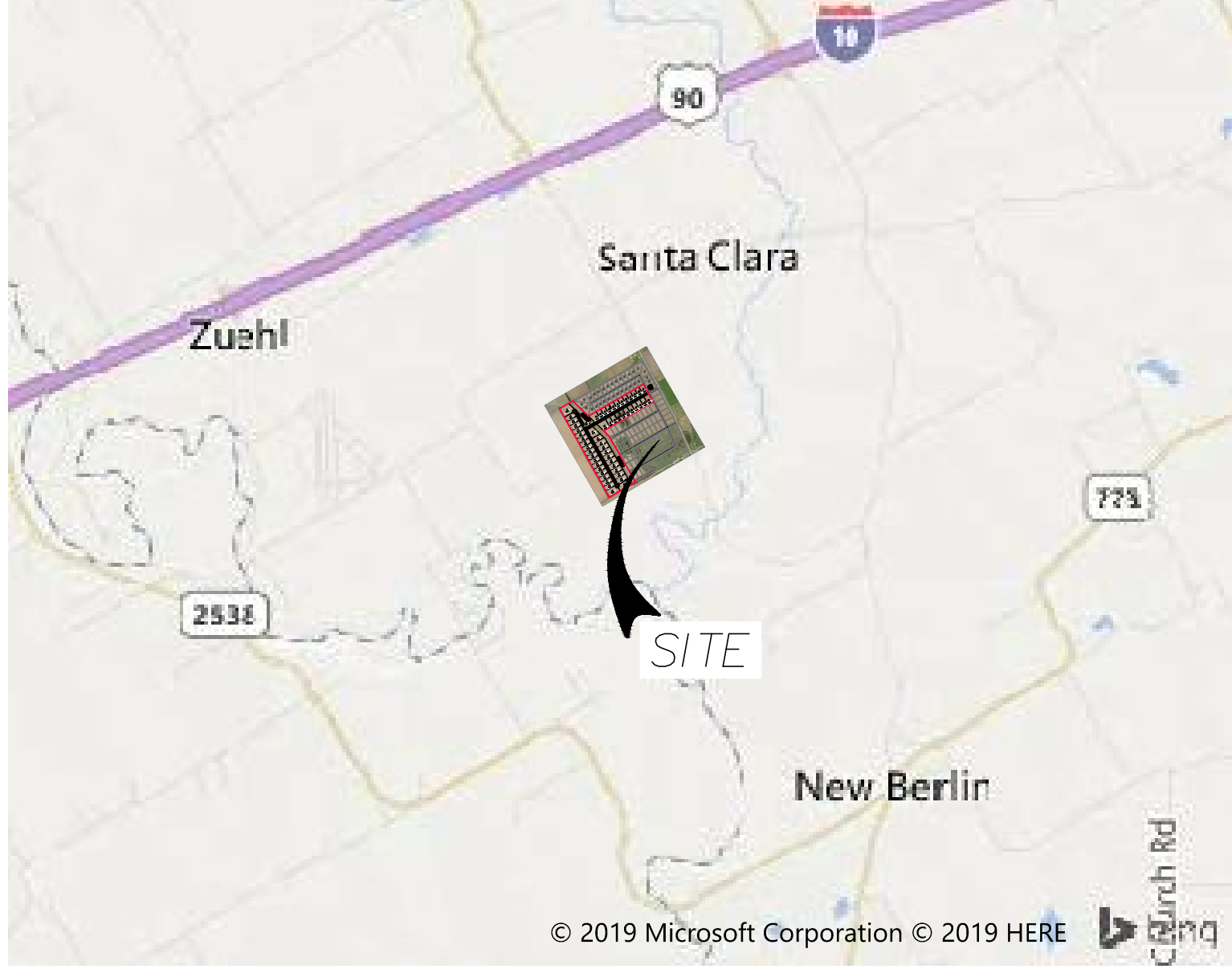
NEW BERLIN, TX VICINITY MAP 1"=5000'