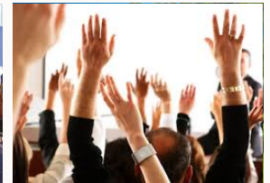
Set the stage for continued growth in study and wisdom.