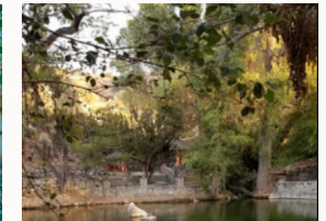
Learn to quiet the inner and the outer distracting noise.