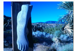
Schedule regular time-away that renews and re-creates.