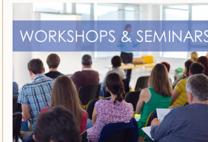
Challenge leadership with new insights and visions.

Bonus: Intro to the ENNEAGRAM transformation tool is also offered to help individuals understand themselves.