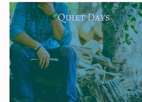
Quiet Day / Weekend retreats at your campus

Prayer is so much more than we realize. It goes deep and teaches us how to listen with God. It includes Contemplative prayer, Lectio Divina, Guided Prayer, Consent Prayers, Welcoming Prayers and a Holy Silence. We offer many different schedules: half day, full day, weekends and longer! Where do you want to start? . We listen to you and your needs. Check website for details.