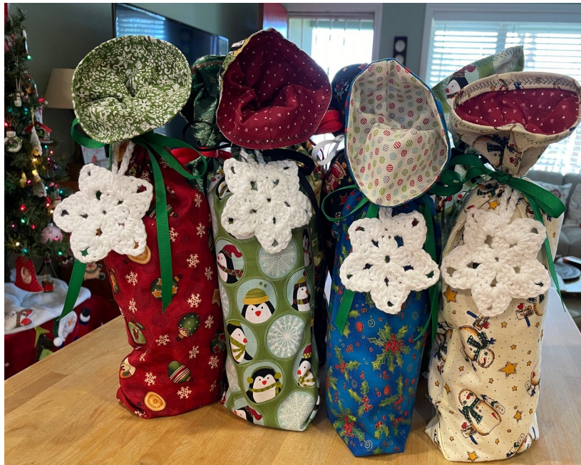
Cheryle's last project for 2021—Wine bottle holders for Christmas presents - filled with homemade cookies (yum).