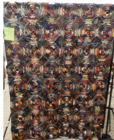
3rd Place Sherry Wagner Pineapple