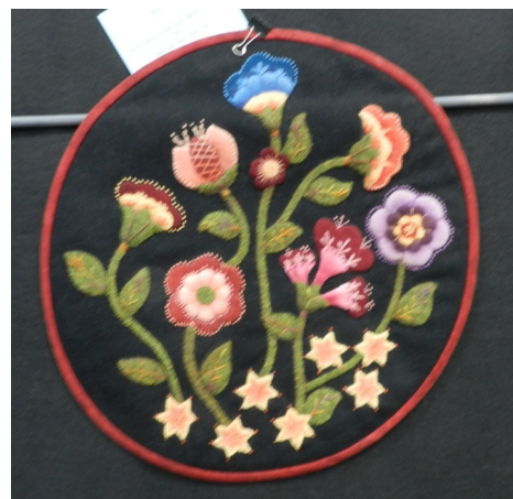
3rd Place Laurel Maloney Midnight Flowers