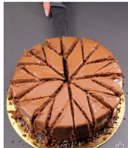
How quilters cut a round cake.