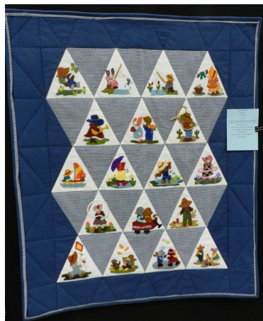
1st Place Sue Bellis Best of Friends