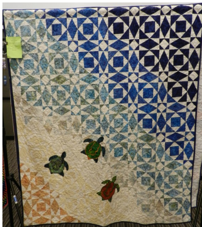
2nd Place Lindy Wilhelm A Day with Polite Pirates