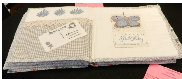
1st Place Robyn Phelps Happy Stitches Journal