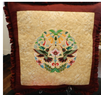
3rd Place Kathy Cadwell Hummingbird Reflections