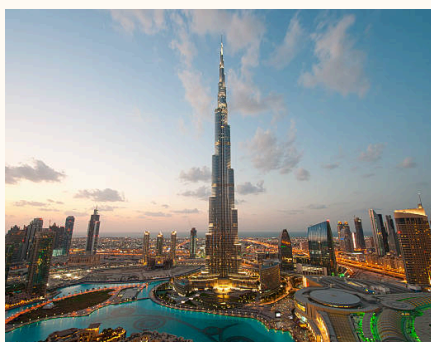
Dubai City Tour + Burj Khalifa