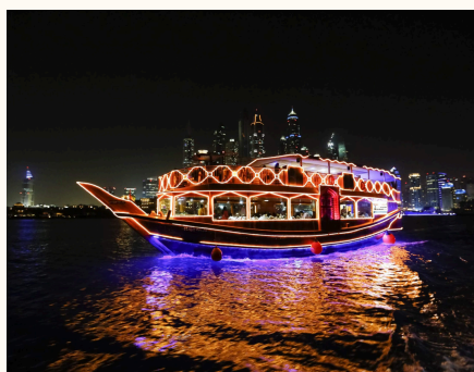
Dhow Creek Cruise