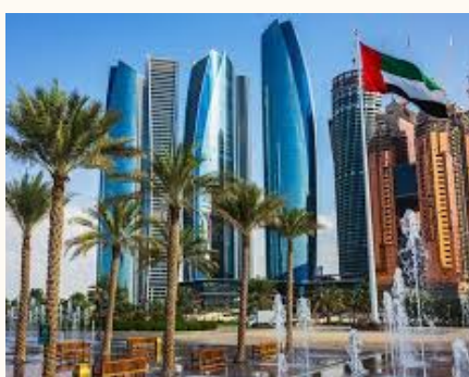
Abu Dhabi City Tour