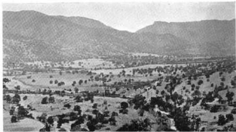
Above: 1880s photo of Capay Valley before the orchards went in near Rumsey.

extend down thro that can never we a sky that is as s sky of southern F under that sky an of the encircling r is only 24 miles lon —everything is p Everything save one thing that me throughout many p