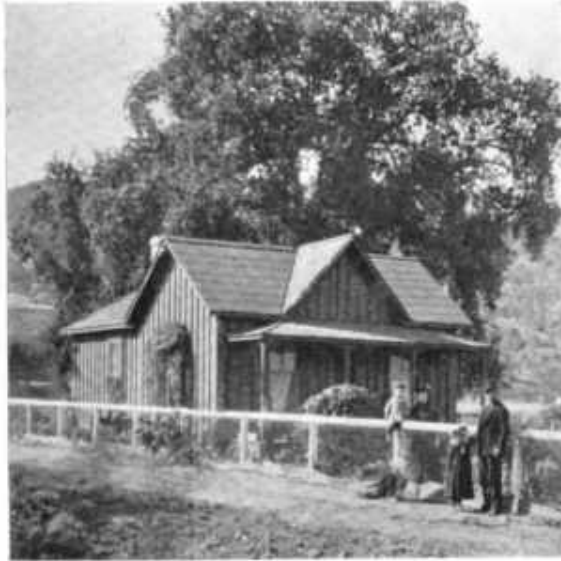
TYPICAL CAPAY VALLEY HOME.

fornia that its owner must be equally generous and the result is always the same. Nature tires out and the ranch passes into other hands. It is no use trying to live the life of a retired country gentleman until you have something to retire on. There are no costly ranch houses from one end of the Capay Valley to the other—not one.