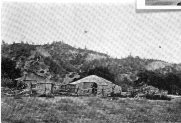
ON THE RANCHERIA, NEAR RUMSEYS.

Text covered from photo of a page at left: