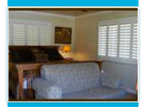
http:// www.capayvalleybedandbrea kfast.com/

as one of only two BnBs—the other is in Rumsey, the Rumsey House BnB . The only other accommodations in the Valley are at the Cache Creek Casino and Resort, also in Brooks.