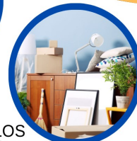
ARTÍCULOS DEL HOGAR