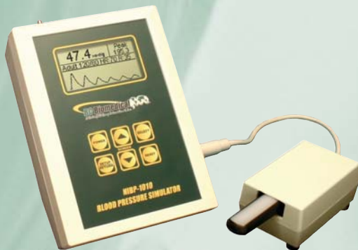
NIBP-1010 with MSP-2100 & FingerSim™