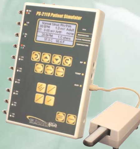
PS-2110 with MSP-2100 & FingerSim™

Wouldn't it be nice to have calibrated fingers?