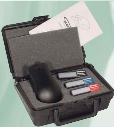
FingerSim™ Starter Set