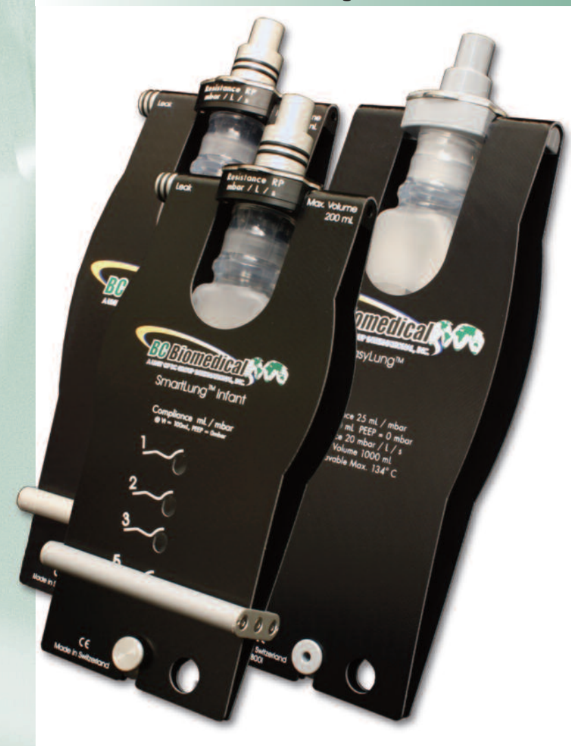
LS-2000A, LS-2000I, LS-1000E

BC Biomedical's Lung Simulator series is an affordable, ultra-portable and easy to maintain alternative to older models. The LS-2000(A/I) SmartLungs come in Adult and Infant models, offering all the performance and features of large and expensive test lungs in an easy to use, compact package. The LS-1000E EasyLung is a simple, low-cost, general purpose test lung with no variable controls.