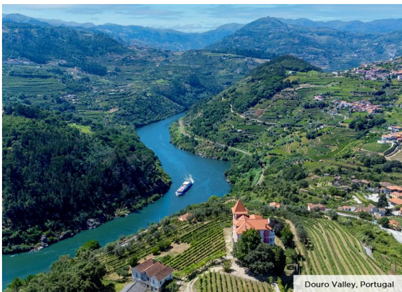
Douro Valley, Portugal

Reserve by July 31, 2026 Save $1250pp OR Free land (Lisbon OR Madrid) + $500pp