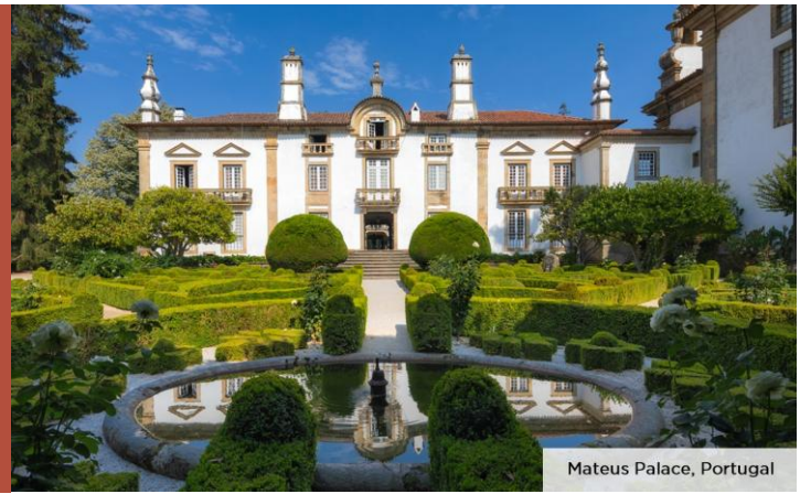
Mateus Palace, Portugal

7-night cruise from Vila Nova de Gaia (Porto) to Vega de Terrón November 13-20, 2027 | AmaVida