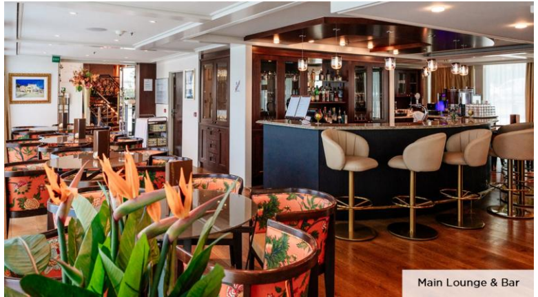
Main Lounge & Bar