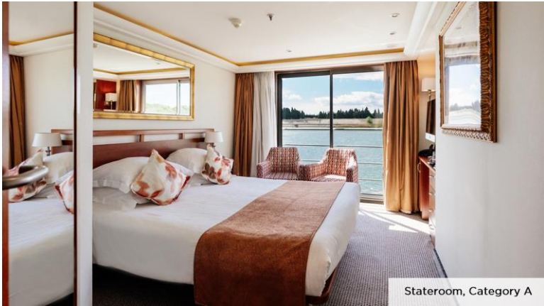
Stateroom, Category A

7-night cruise | November 11-18, 2027 | Aboard AmaCello