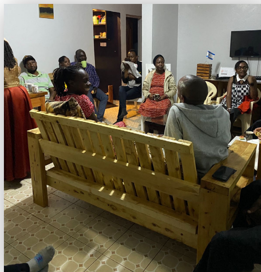
Couple's Hangout in Eldoret, Kenya