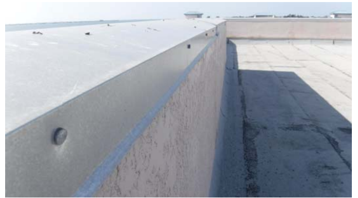
Mechanically fastened flashing