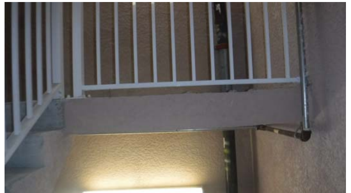
Concrete roof decking