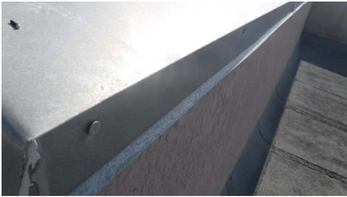
Mechanically fastened flashing