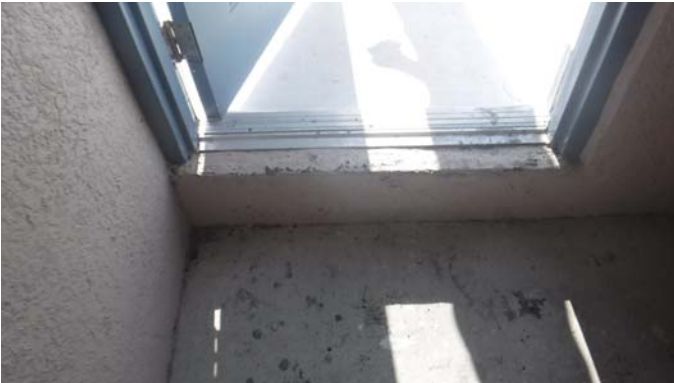
Concrete roof decking