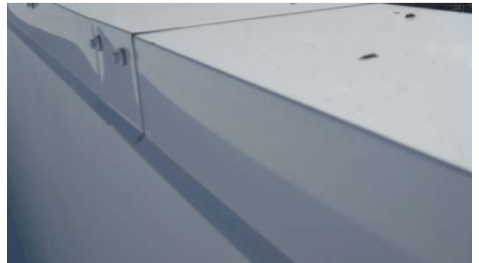
Mechanically fastened flashing