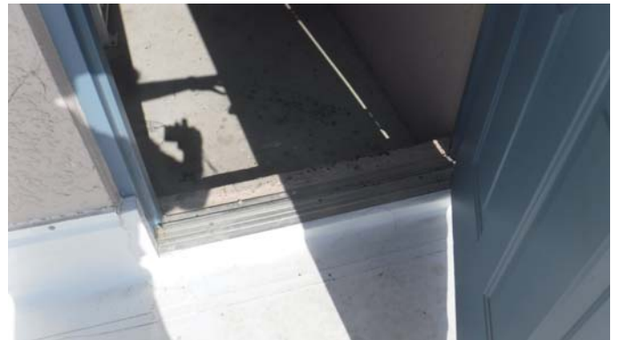
Concrete roof decking