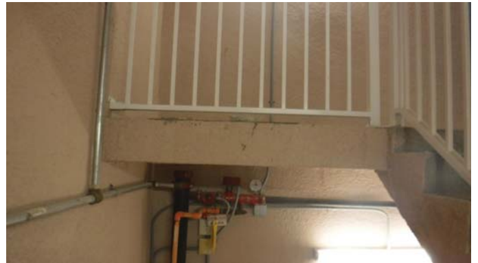
Concrete roof decking