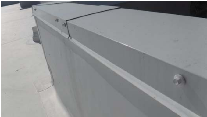
Mechanically fastened flashing