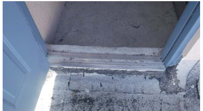
Concrete roof decking