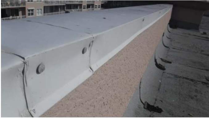
Mechanically fastened flashing