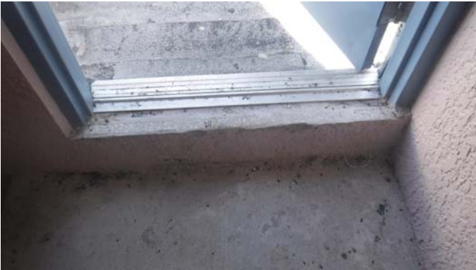
Concrete roof decking