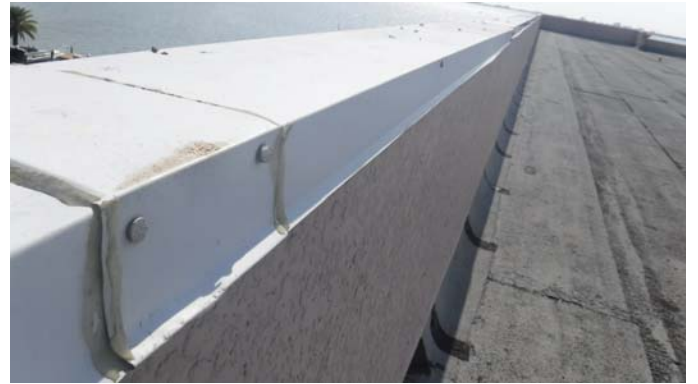
Mechanically fastened flashing