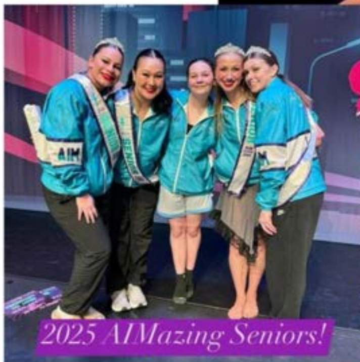
2025 AIMazing Seniors!