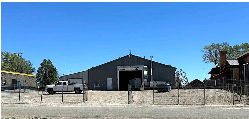
Dove Creek's Ag Vocational Building is set to be replaced this summer. More details soon....

The Town of Dove Creek will be installing a pavilion at Weber Park to provide additional shaded area. The Recreation Department has already begun the summer youth programs that use the facilities, along with a variety of youth summer sports. And the Pick N Hoe is just a month away! Be sure to sign up for ROYALTY and plan for your float in the parade on the 4th - meeting at the airport by 8:30 parade to kick off at 9am. picknhoe@usa.com