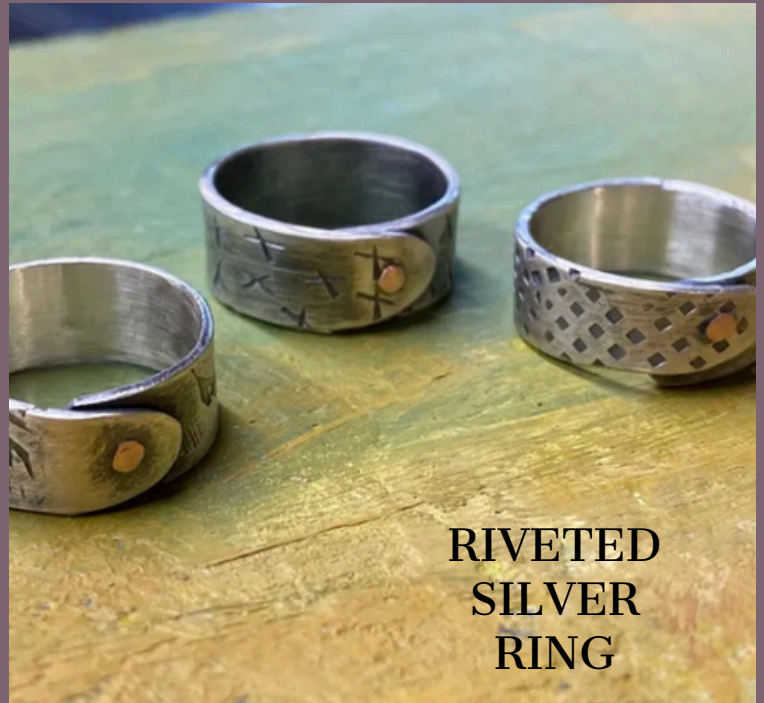
RIVETED SILVER RING