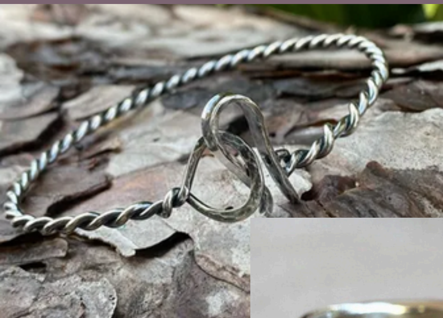
TWISTED SILVER BRACELET