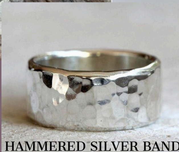
HAMMERED SILVER BAND