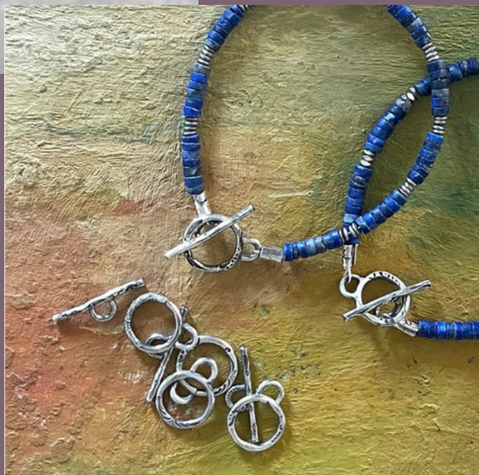
LAPIS TOGGLE BRACELET