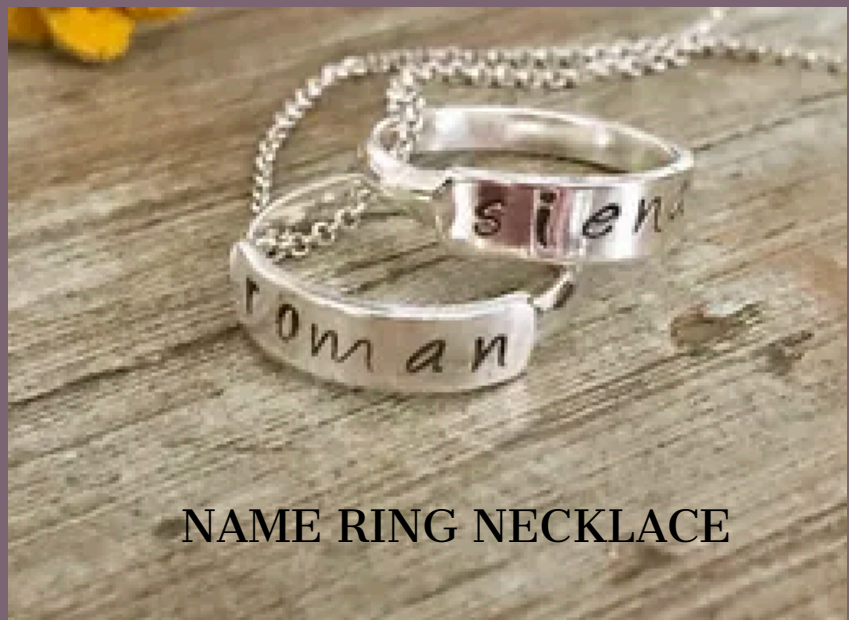
NAME RING NECKLACE