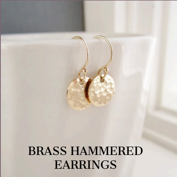
BRASS HAMMERED EARRINGS