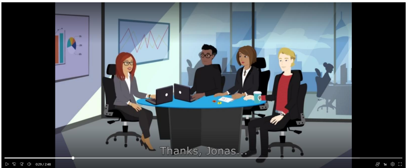
Example of an Animation Video on the Exam

Enhanced Matching: For most enhanced matching (drag and drop) items, candidates will see two columns of boxes. They will be given a scenario and will need to match the boxes on the left with the boxes on the right (opposite for Arabic candidates). They will simply click and drag one of the boxes on the left-hand side and place it on the appropriate box on the right-hand side. They will do this for all the boxes in the left-hand column.