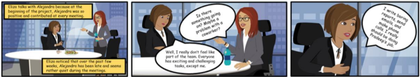
Example of a Comic Strip on the Exam

Animation video: For animation video items, candidates will watch the animation video. Candidates can watch the animation multiple times and use the video controls to start, stop, rewind, etc. Based on the scenario, the candidate will be presented with a multiple-choice question to answer. Candidates will receive headphones at the testing center. The animations will have audio and will also include closed captioning.