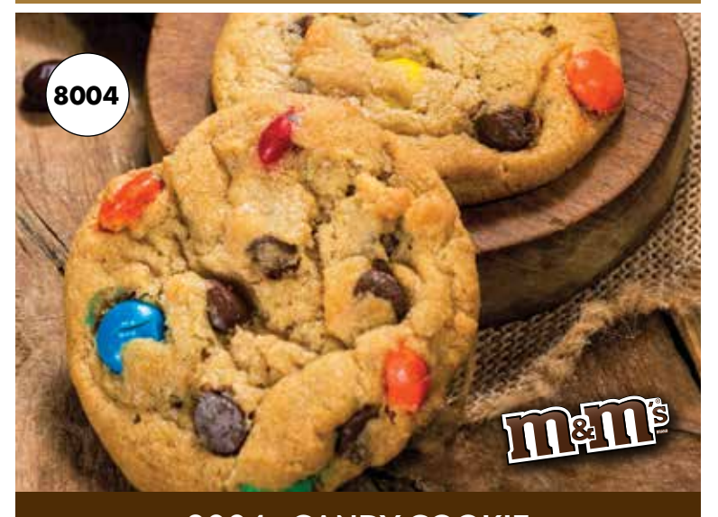
8004 · CANDY COOKIE MADE WITH M&M'S® • $20