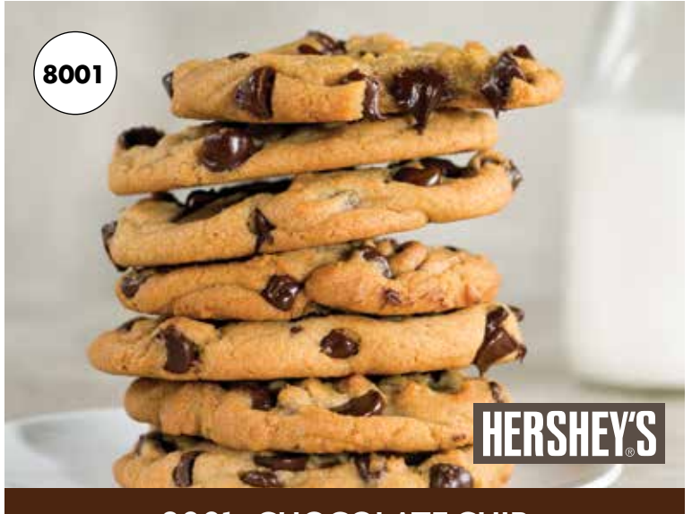
8001 · CHOCOLATE CHIP WITH HERSHEY'S® CHIPS · $20