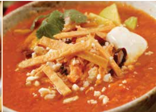
4002 · FIESTA SOUP TRIO MIX · $18

All of our Fiesta soup mixes in our signature box. Add your ingredients to make one each: Chicken Enchilada Soup Mix, Tortilla Soup Mix, and Taco Soup Mix. Each packet serves 6-8.