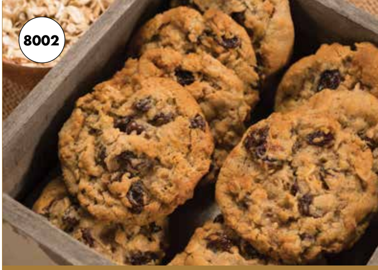
8002 · OATMEAL RAISIN · $20