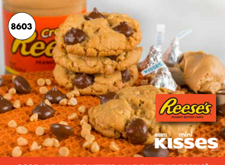
8603 · PEANUT BUTTER MADE WITH REESE'S® PEANUT BUTTER CHIPS & HERSHEY'S® KISSES • $20