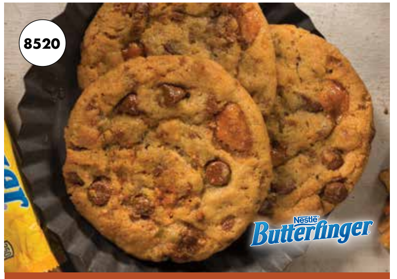
8520 · MADE WITH BUTTERFINGER® · $20