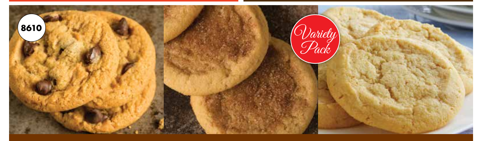
8610 · COOKIE LOVER'S VARIETY PACK · $22 20 CHOCOLATE CHIP, 10 SNICKERDOODLE, 10 SUGAR COOKIE