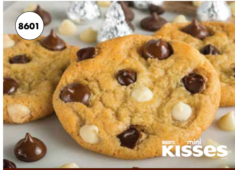
8601 • TRIPLE CHOCOLATE BLONDE WITH HERSHEY'S® KISSES • $20