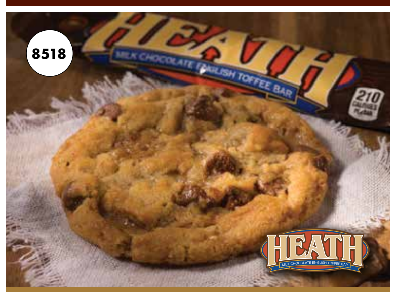
8518 · BUTTER TOFFEE WITH HEATH® · $20