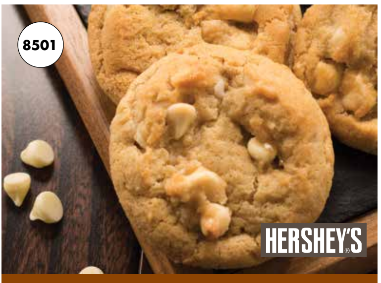
8501 · WHITE CHOCOLATE MACADAMIA NUT WITH HERSHEY'S® VANILLA CHIPS · $20