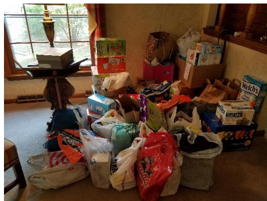
Brown Street Academy Donations