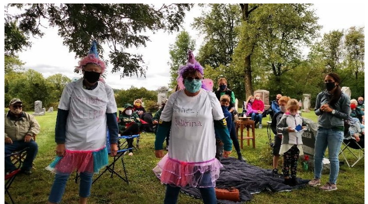
Outdoor Service September 13, 2020