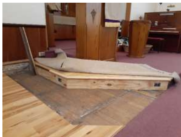
Construction is underway to make the sanctuary more accessible.