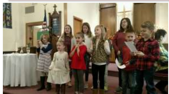
Children's Veterans Day Tribute November 10th