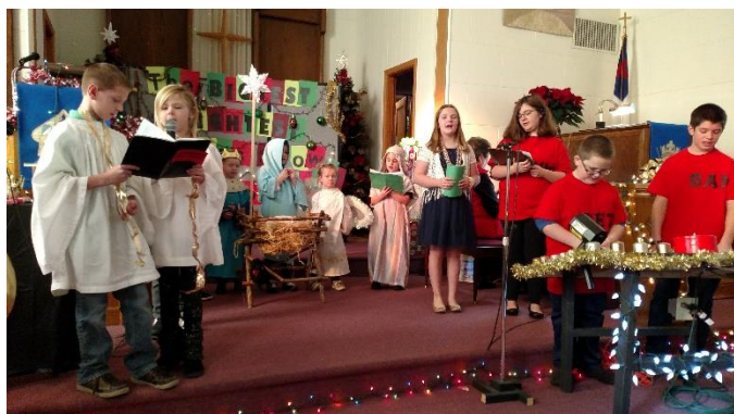
Children's Christmas Program December 15th

View the agenda and confirmed speakers at the National Youth Event website