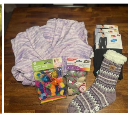
The kids donated Christmas gifts to individuals through Family Promise of Washington County- an idea that came from a St. Paul's member! We appreciate all your great ideas! Way to go kids!