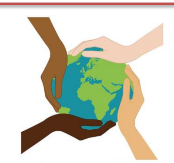
Healing our Earthly Home

The meeting was very short with virtually no new business since our previous meeting. We again discussed ideas about ways to hold a Guild fund raiser. Several possibilities were suggested, but no plans or decisions were made.