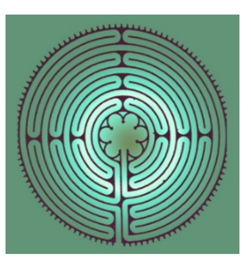
Sussex congregation opens doors to May 6 labyrinth retreat

Thank you also to all of the members who donated flowers for Easter in