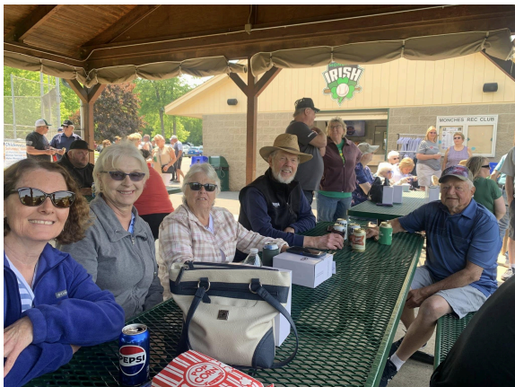
Thank you to everyone who came to the Monches Fellowship event on June 3rd.