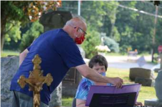
Photos from the July 26 th outdoor service