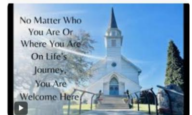
YouTube St Paul's UCC Erin church service ...