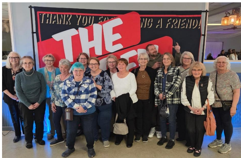
Golden Girls Murder Mystery outing