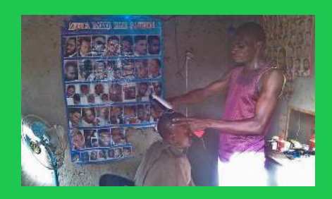
Providing power to an off-grid community in Kigbe, Nigeria