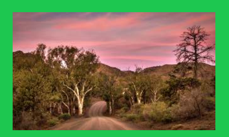
Going off-grid instead of living at the edge of the grid