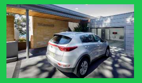
A flexible and cost-effective battery storage solution for a high-end residential development