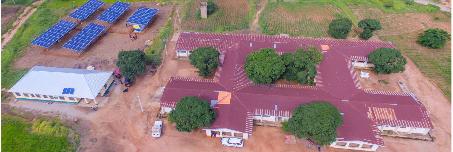
EM-ONE deployed the EM-BOX to 13 rural hospitals in Nigeria including this rural hospital in Kaduna State.

EM-ONE, a Canadian-Nigerian engineering, technology and consulting firm, delivers sustainable energy to West Africa. They built the EM-BOX, a turnkey microgrids solution to address their fundamental belief that access to modern, affordable and sustainable power is a basic human right. In 2019, EM-ONE deployed the EM-BOX to 13 off-grid rural hospitals in Nigeria. The containerized solar microgrids power the health centers' critical functions such as lighting, X-ray machines and water pumping, improving the lives of the local residents.