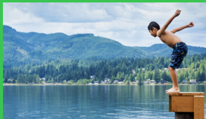
Powering remote island with sustainable electricity