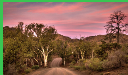
Going off-grid instead of living at the edge of the grid