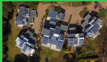
One Everton – A South African flagship for communal energy independence