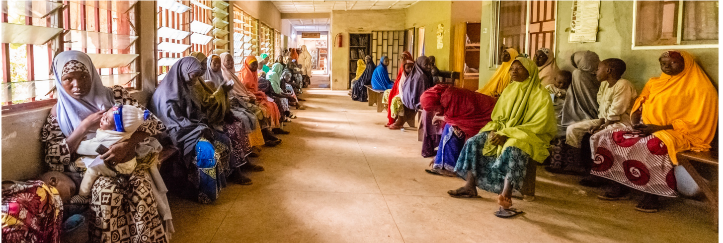
Waiting room in a rural hospital

In late 2019, EM-ONE, in partnership with UK Aid and the EU, has commissioned 13 off-grid containerized solar microgrids that power primary health centers across Kaduna State, Nigeria.