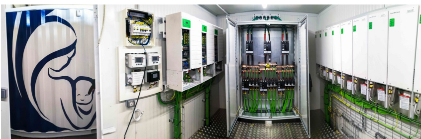
Inside of the EM-BOX

The health centers now can operate 24/7 and improve millions of people's lives thanks to the off-grid containerized solar microgrids EM-ONE deployed.