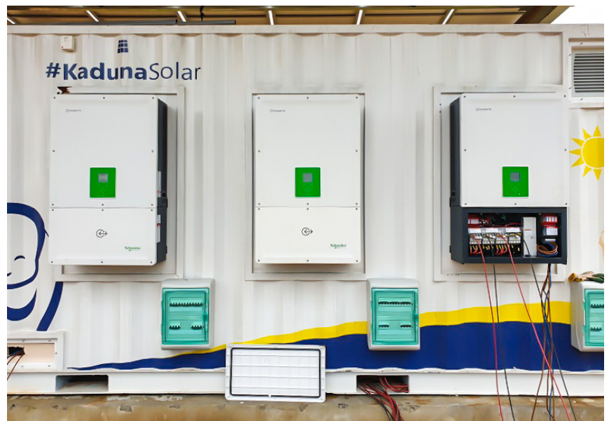
Exterior of the ES-BOX

The 13 systems will generate over 1,300 MWh of energy annually, offset over 520,000 liters of diesel, and reduce nearly 1,400 tons of CO2 emissions per year.