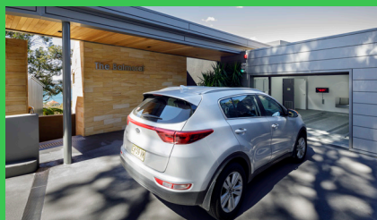
A flexible and cost-effective battery storage solution for a high-end residential development