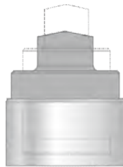
C.D STN adaptor