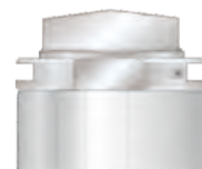
Trumpf punch adaptor