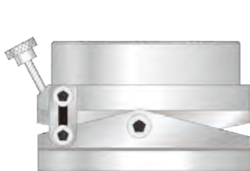
Fixture base (E STN)