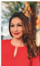
Dr. Jess O'Reilly

Women over 50 will face different intimate health issues than woman under 50. The hormonal shifts that occur during menopause are responsible for more than just hot flashes and mood swings. They signify a loss of estrogen and testosterone, which can lead to changes in a woman's body such as dryness and laxity. The tissue in the vaginal area and the bladder region can lose tone and elasticity, which in turn decreases the body's ability to keep things functioning as they once did.