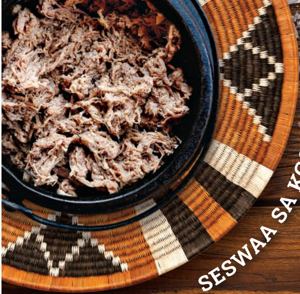
SESWAA SA KGOMO