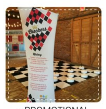
- PROMOTIONAL MATERIALS - 11 UNIQUE INTERACTIVE AREAS - EACH CHILD TAKES HOME A GAME THEY CREATE

AMAZING GAMES is a "hands on" traveling exhibit that lets the visitor play games, create games, and discover the history of games. With more than 12 components making up this interactive exhibition, it's easily assembled, enjoyed by all ages, and is a great way to invite your community to come and PLAY!