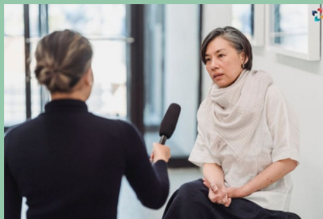
summarizing skills in an interview context

Keep in mind that summarizing, while a useful tool, is different from reflective listening. Reflective listening, content or meanings involves breaking into the monologue of the other to capture bite-sized pieces of the communication. Summarizing occurs after the speaker has finished a larger piece. Summarizing is useful at the end of a piece of communication, to capture the overall essence of the communication and to come to closure on it.