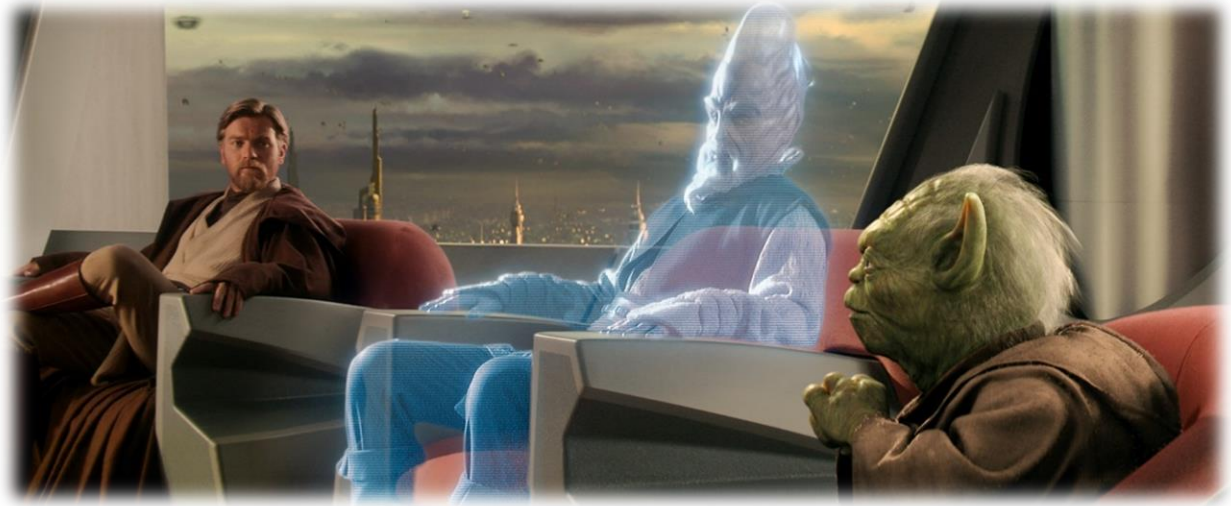
Figure 4. Jedi Council meeting with holographic participant.

Solutions put out by Spatial , Valorem Reply's Holobeam , and Mimesys are a few examples of working telepresence applications. Spatial's product is avatar-based , while Valorem Reply's Holobeam uses volumetric video . Both work on HoloLens 1 and 2, but Spatial is cross-platform to include Oculus Quest VR headsets, Magic Leap, and nReal AR glasses. Also, Spatial can be integrated with Microsoft Teams . In order to see one another as holograms the patient and the remote clinician each wear an AR/VR headset.