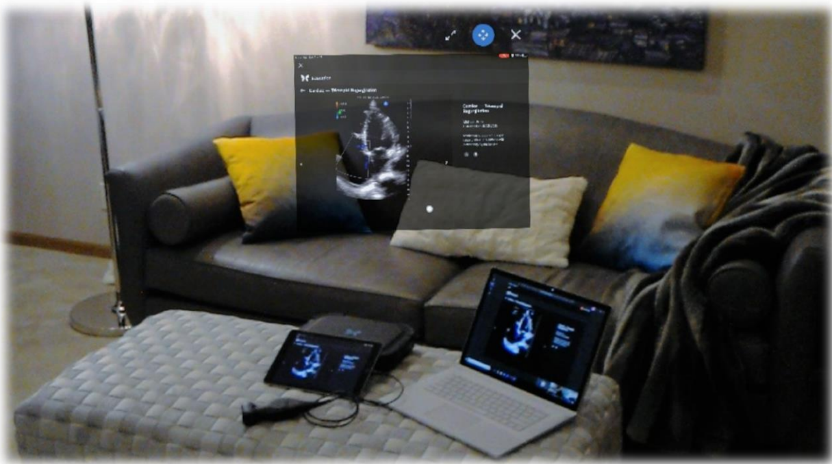
Figure 3. View of HOCUS POCUS session through the HoloLens; Note holographic screen of POCUS video floating above the couch cushions.

Up until now, I have described how Microsoft Teams can enable and augment novel TelePOCUS visits between clinicians and patients. We've demonstrated how the addition of Microsoft HoloLens can enhance the visual inspection part of a physical examination and enable hands free communication between a remote expert and HCW who is present in the room with a patient. With remote sharing of POCUS images, the combination of these modalities can surpass a conventional face to face physical examination, but to the patient...things don't seem all that different from telehealth video visits they've experienced previously. However, if a hologram of the remote expert could be right in the room with the patient, THAT would be different!