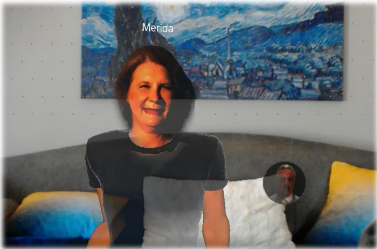
Figure 5. Housecall visit with a holographic patient; This session utilized Spatial's collaborative telepresence software. Patient was on Oculus Quest. Physician was wearing HoloLens 1.

One of the main limiting factors in the holographic component of the HOCUS POCUS model is the relative shortage of AR and VR headsets that currently exists. However, the expansion of low-latency, high speed 5G cellular service and the proliferation of companies entering the AR and VR headset market should drive the solution to this deficit. If it weren't for the scarcity of HoloLens 2 devices or other AR headsets, the full HOCUS POCUS model could be implemented widely now, too.