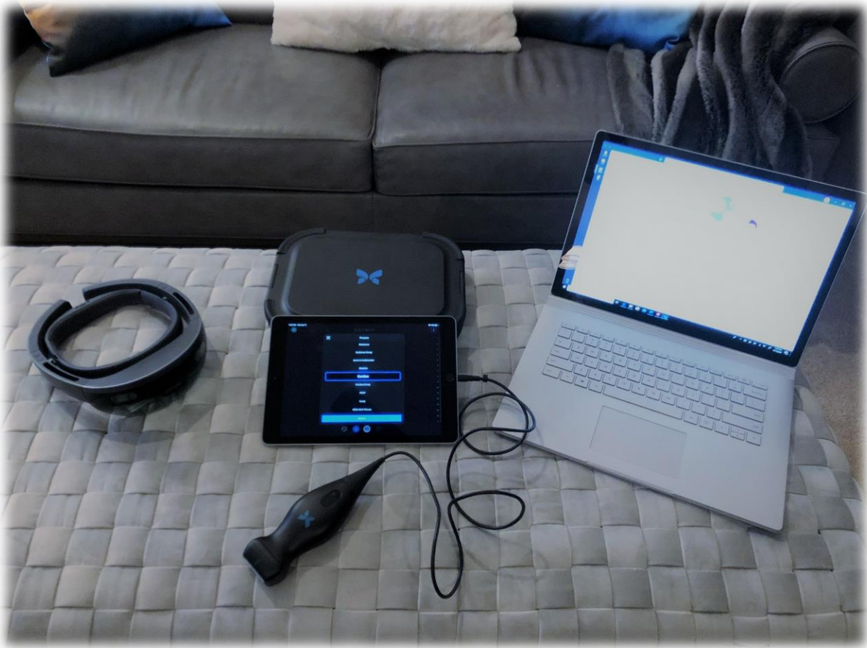
Figure 2. Components of full HOCUS POCUS setup. Microsoft HoloLens (L); Butterfly IQ POCUS probe with iPad (Middle); Microsoft Surface Book 2 (R).

To review, HOCUS stands for H olographic O nsite C are U nder S upervision. Let's start with the holographic part. In the digital spatial computing world, hologram has come to mean the superimposition of a digital image or 3D object on top of the real world. The most sophisticated systems have transparent head-mounted displays such as Microsoft HoloLens 2 or Magic Leap 1 . This digital enhancement of the real world is called Augmented Reality or AR. Microsoft HoloLens 1 and 2 work with Microsoft Teams in conjunction with Dynamics 365 Remote Assist software. With Remote Assist, a remote expert can see exactly what the HoloLens-wearing healthcare worker is seeing in a patient's room, and conversely the healthcare worker in the patient's room sees a Teams video screen floating in mid-air in front of them with the remote expert's video displayed. If the screen of the tablet which is connected to the POCUS probe is brought in as a third "participant" in the meeting, the tablet screen can be shared with the participants. The Healthcare worker in the patient's room can see the POCUS video displayed in real time as a floating screen in front of them, and the remote expert can see it too on their monitor (Figure 3).