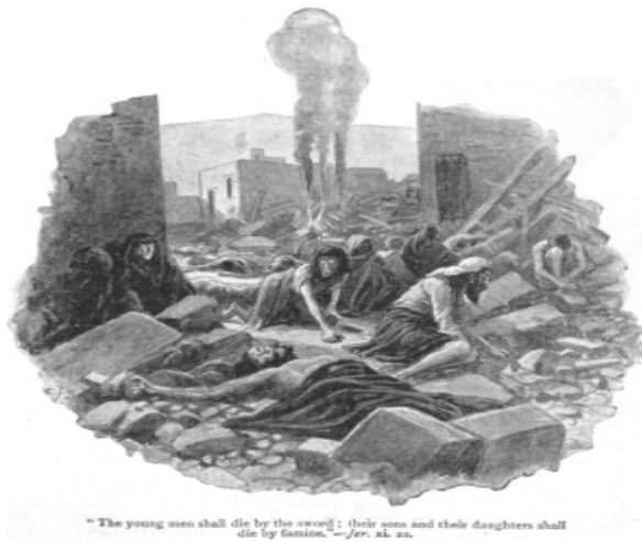
“The young men shall die by the sword; their sons and their daughters shall die by famine.”—Jer. 34:30.

“And I looked, and there was none to help; and I wondered that there was none to uphold: therefore mine own arm brought salvation unto me; and my fury, it upheld me. And I will tread down the people in mine anger, and make them drunk in my fury, and I will bring down their strength to the