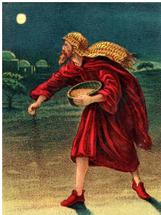
Sowing tares: the enemy thought to carry away the SDA church by the influence of the unconverted.

It is by this plan (which has already met with success in the