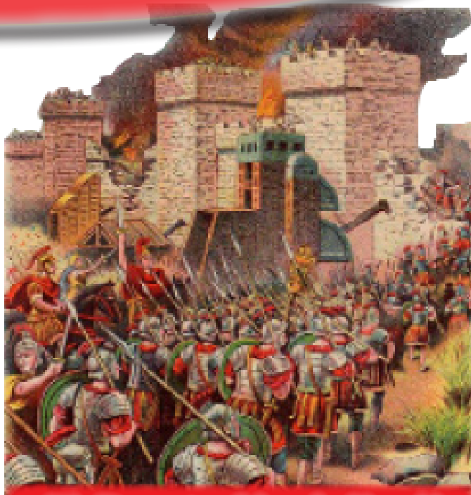
The Destruction of Jerusalem Foretold

“O Jerusalem, Jerusalem, thou that killest the prophets, and stonest them which are sent unto thee... For the leaders of this people cause them to err; and they that are led of them are destroyed.” Matt. 23:27a, Isa. 9:16