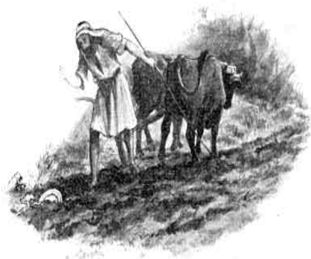
“The kingdom of heaven is like unto treasure hid in a field...” Adventists stopped searching for truth and became afraid of encountering error.

afford to be fair. No true doctrine will lose anything by close investigation.” {CW 35.2}