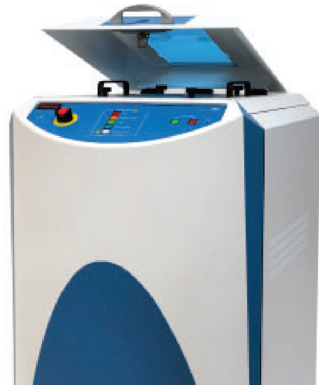
Custom fixtures include universal package adaptors to enable the industry's lowest cost-in-service high pin count device fixturing yet devised. (2304-pin, Universal 1-mm pitch BGA package adaptor shown.)

As such, the strategically-designed, field upgradeable architecture of the MK.4TE Test System ensures a substantial return on investment over a very considerable test system lifecycle, as well as better short- and long-term quality and ESD & Latch-Up test economies.