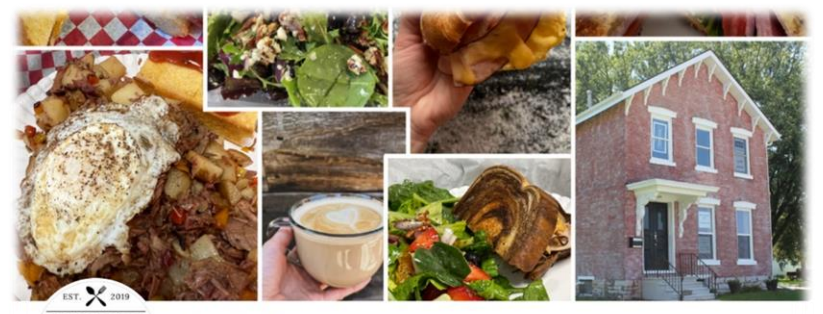
WEST West End Diner

<u>West End Diner</u> - Marion's local hot spot for breakfast and lunch, coffee, cocktails and patio dining. They offer Sandwiches, soups, Scrambles/Burritos, Entrees...and their famous brisket on Wednesdays! Everything I have eaten here was truly delish!