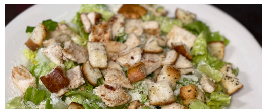
Grilled Chicken Caesar Salad