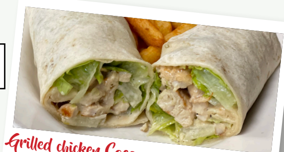
Grilled chicken Caesar wrap w/fries $12