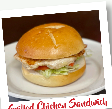
Grilled Chicken Sandwich