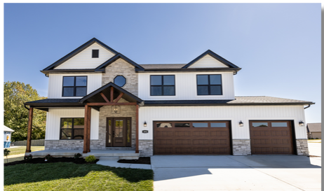
The Tucker 3,000 Sq. Ft