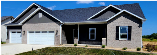
The Kingston 1,900 Sq. Ft