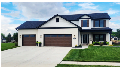
The Fitzpatrick 2,114 Sq. Ft