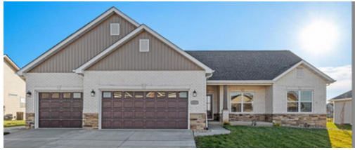
The Devonshire 1,900 Sq. Ft

Floor Plans in pictures may have options above the standard pricing