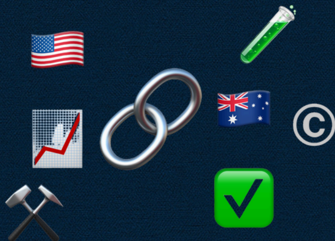
Most used Emojis