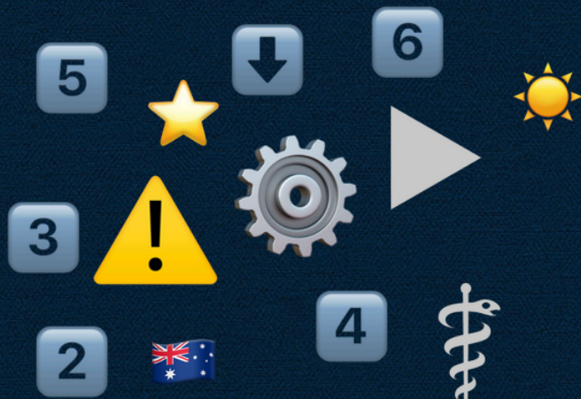
Most used Emojis